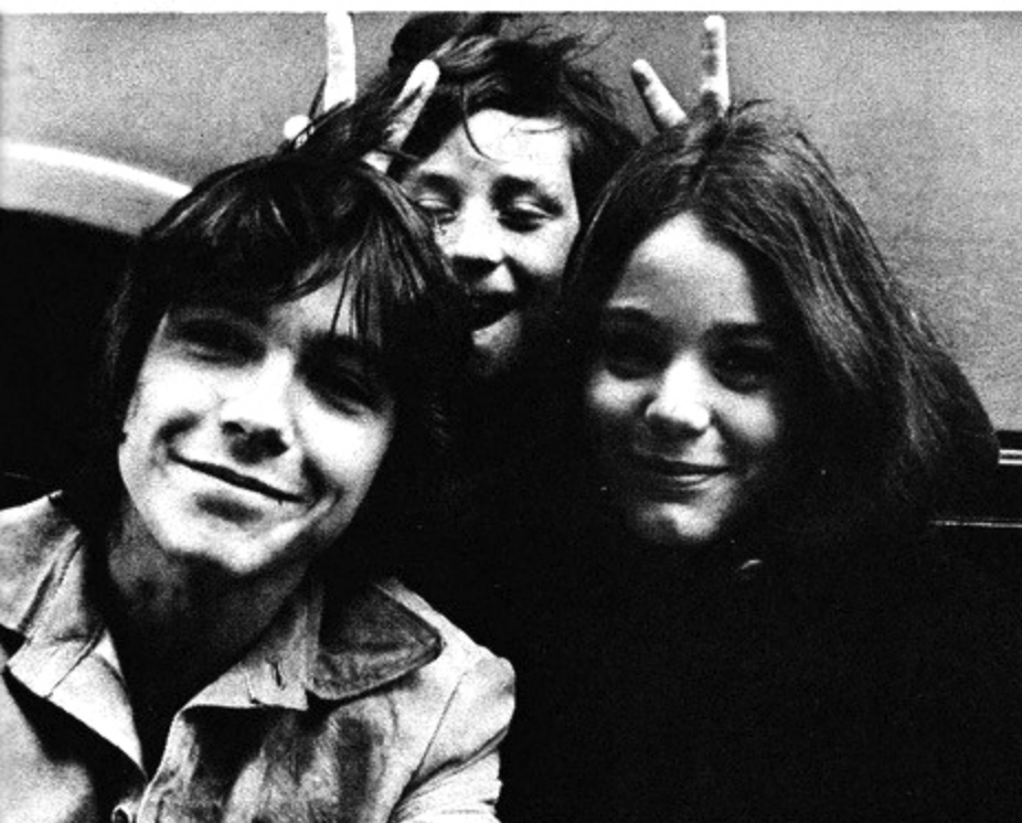
David, Danny Bonaduce and Susan Dey are having a good time working together on "The Partridge Family." You can sure tell it!

Although his father is the famous actor-singer Jack Cassidy and his step-mother is the musical comedy star Shirley Jones (she's co-starring with him in "The Partridge Family"), David achieved his success completely on his own. The last thing he appears to be is the product of a show business childhood—with an "in" to people and opportunities. Whatever he got, he worked