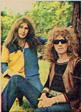
Overend with lead singer Ian Hunter

"In ten years' time, I'd quite like to be running a shop of my own," he says. "It could be a music shop or a guitar shop... but I'd rather it was a chess shop."