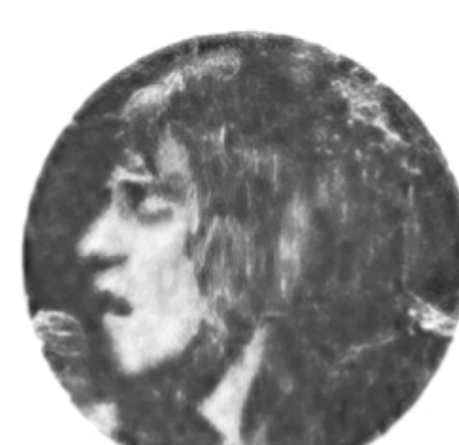
B5. Rod Stewart