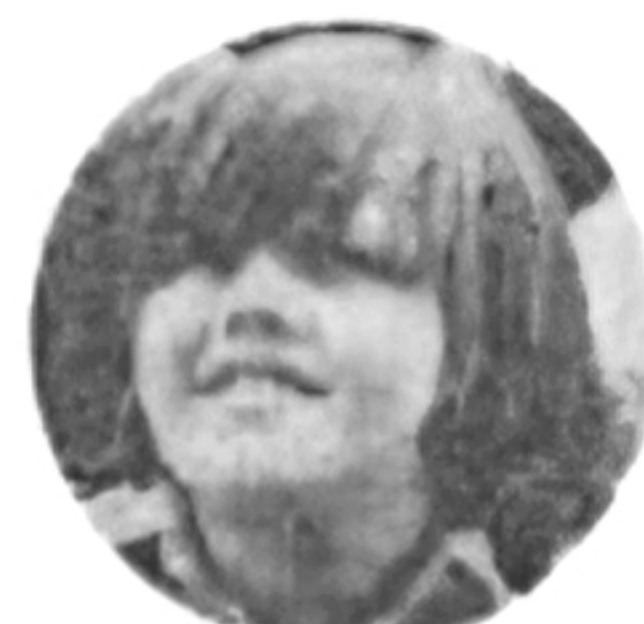
B15. Jimmy Osmond