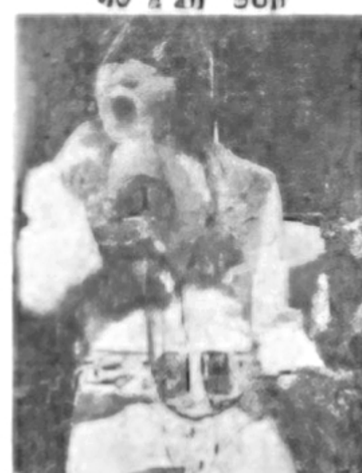
100. Jimmy Osmond 38"x 25" 50p