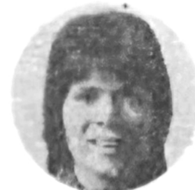
B21. Cliff Richard