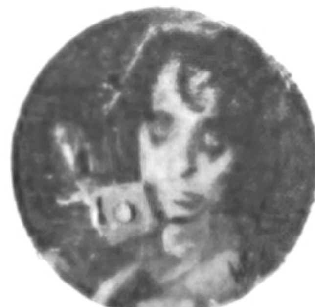
B20. Alice Cooper