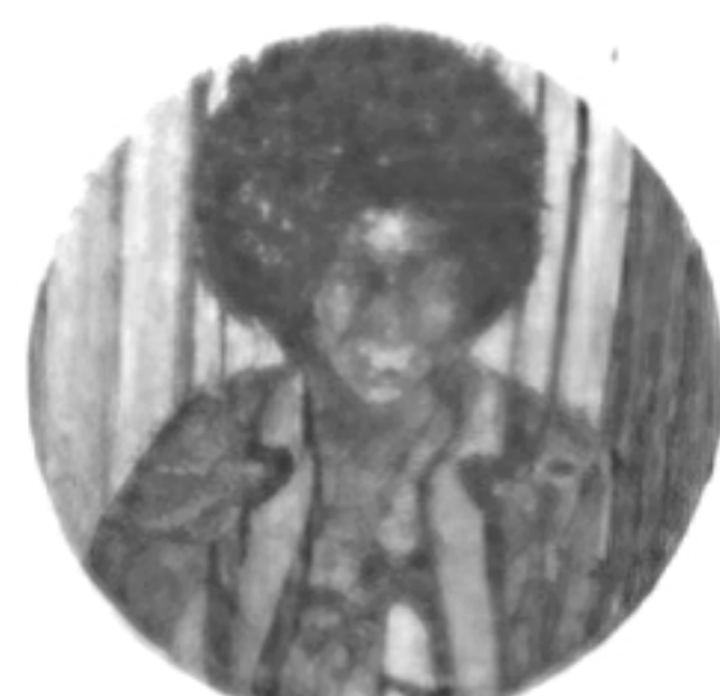
B1. Michael Jackson