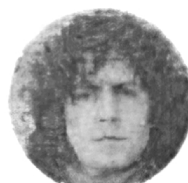
B6. Marc Bolan