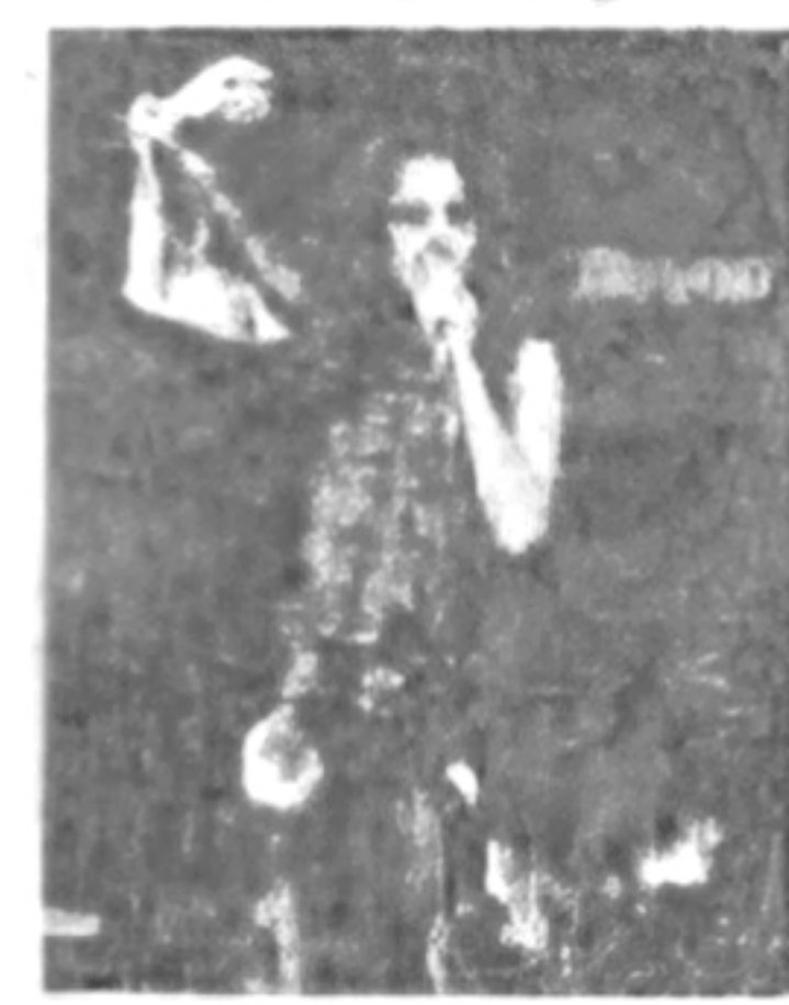
4. Alice Cooper 40"x 30" 50p