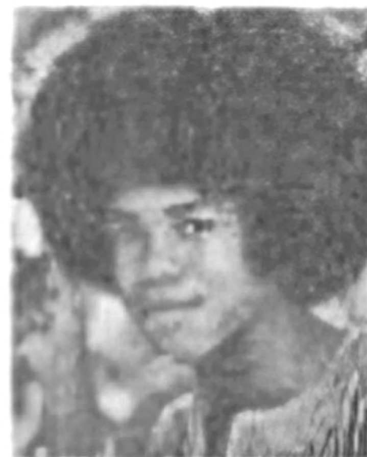
105. Jermaine Jackson 38"x 25" 50p