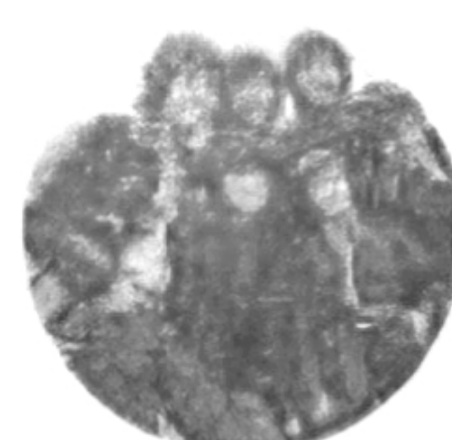
B14. The Osmonds