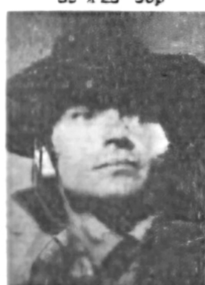
80. Pete Dinklage 38"x 25" 50p

order - fantastic news-sheets showing all our latest releases of Posters, etc. etc.