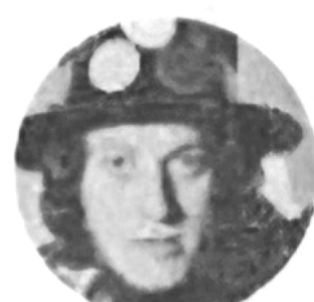
B19. Noddy Holder