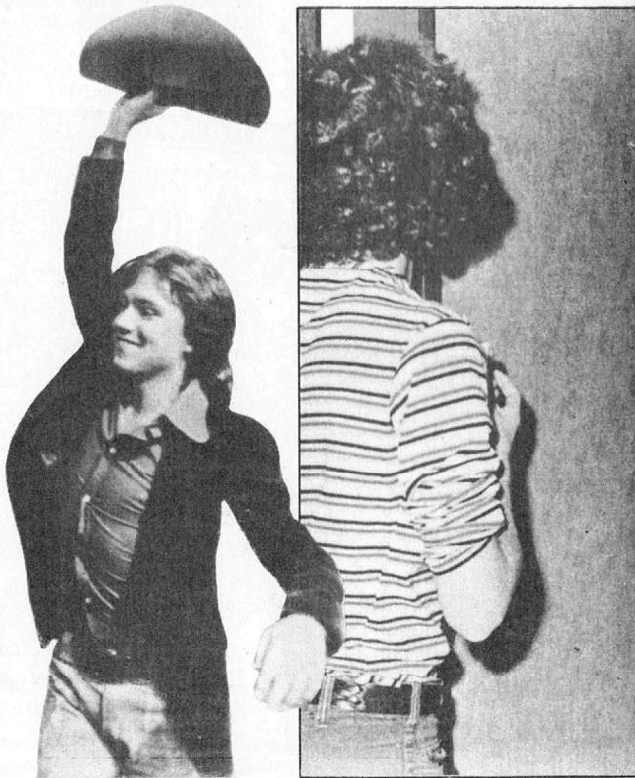
Thursday's child has far to go