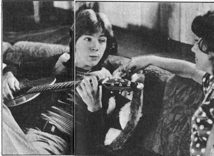
Tuesday's child is full of grace