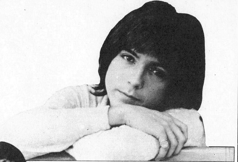
Wednesday's child is full of woe