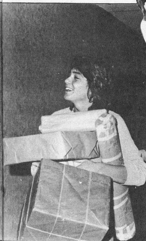
Friday's child is loving and giving