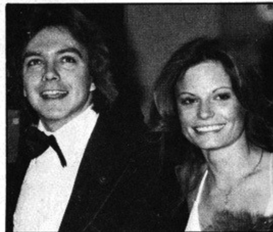
THE person who turned David's life around was talented actress Kay Lenz.

D: I went through a really bad period after "The Partridge Family" went off the air. Because of the amount of work I was doing, I lost myself, my sanity. I felt robbed of my identity. Everyone wanted "Keith Partridge." They wanted that image. I wanted to be alone and decided I didn't want to work anymore. I packed up my things and moved to Santa Barbara and for nine months, I was like a hermit. When you don't like yourself or what you've become, it's very difficult to like anybody else. All my friends and family sensed that. I was irrational, concerned about the wrong things, and very bitter.