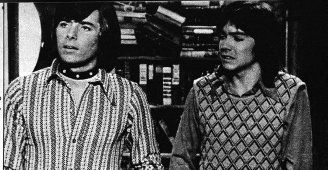
TWO teen idols side by side! Bobby Sherman's series, "Getting Together," was started on an episode of "The Partridge Family." Weren't they both cute?

D: Yes, in fact, when I look back on it now, I just remember the good things. If you balance it out, there probably was more good, anyhow.