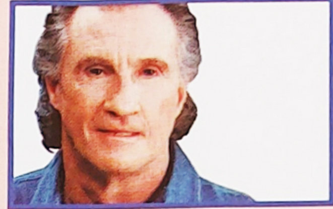
BILL MEDLEY at RIVERSIDE RESORT