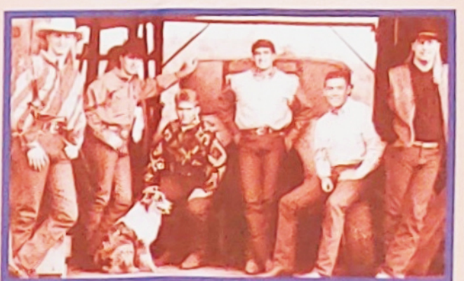
SMOKIN' ARMADILLOS At RIVER PALMS