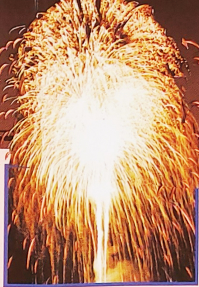
FIREWORKS At the AVI