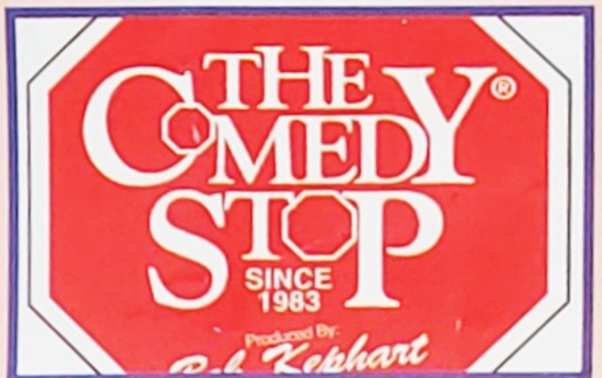
COMEDY STOP At FLAMINGO