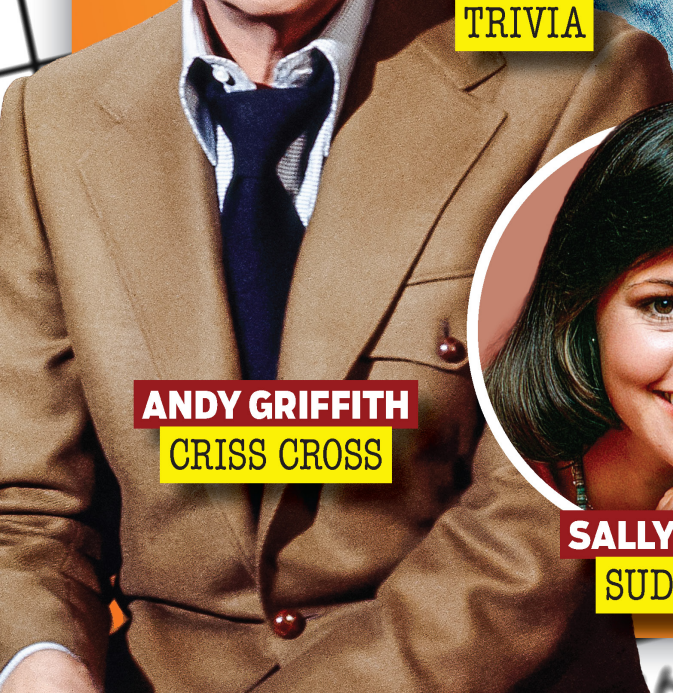
ANDY GRIFFITH CRISS CROSS