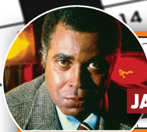
JAMES EARL JONES