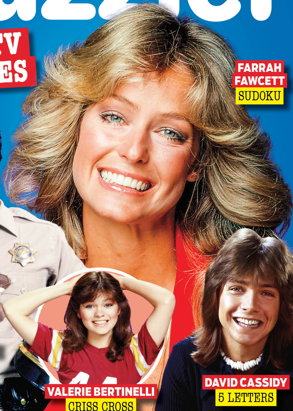
VALERIE BERTINELLI CRISS CROSS